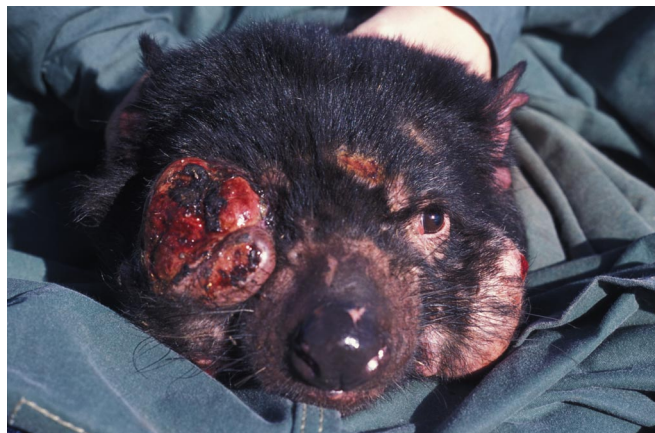
Fig. 1. Tasmanian devil facial tumor disease, a recently emerged infectious cancer, has caused virtual semelparity and a dramatic increase in the proportion of juvenile females breeding.

Symptoms resembling DFTD were first reported in 1996 and by 2007 had spread over more than half of the species' range on the island of Tasmania (Fig. 2), including the majority of higher-density populations (9, 10). Populations affected by DFTD have suffered declines as great as 89% (9, 10). This consistently fatal disease is an infectious cancer, thought to be transmitted by allograft, with tumor cells spread directly between devils through biting (11, 12). Very low diversity in MHC genes, which play a key role in immune response to tumors and grafts, enables transmission (13). The tumors primarily affect adults (animals \geq 2 years old) and cause death within months. Evidence that most penetrating biting injuries occur among adult males and females in the mating season (14) and that the disease